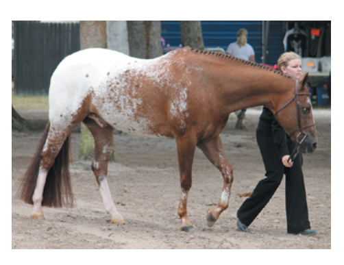
22. Large blanket with lightning marks