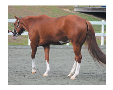
17. Bragada sabino