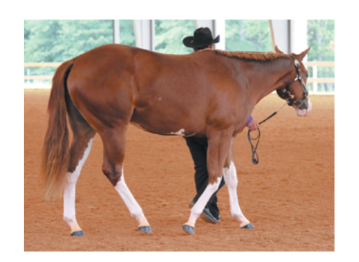
14. Bragada sabino