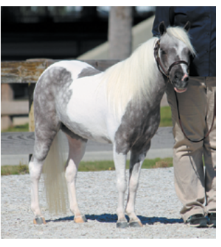
15. Silver dapple tobiano