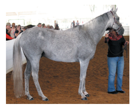
20. Fleabitten grey