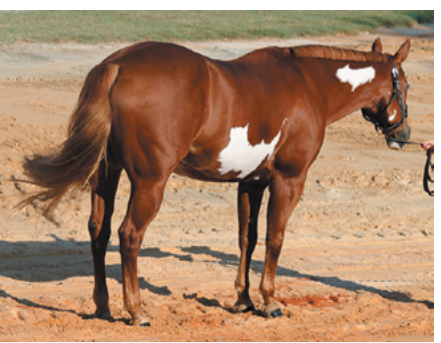
24. Frame overo