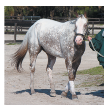
18. Color-shifted appaloosa