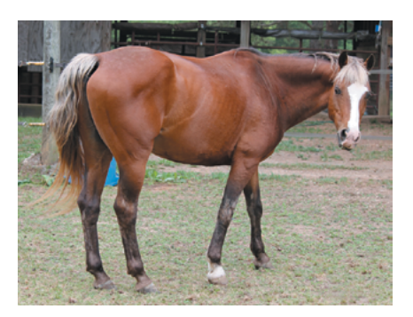
26. Bay silver