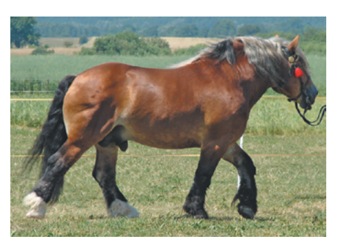
2. Bay with frosted mane