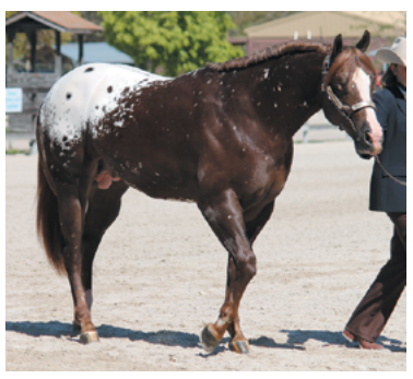
21. Blanket with snowflakes