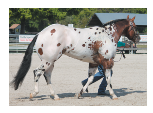
19. Large blanket with lightning marks