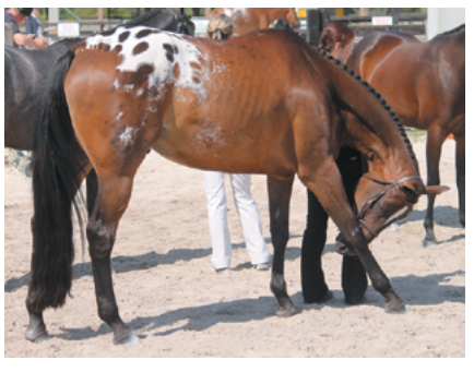
27. Spotted blanket