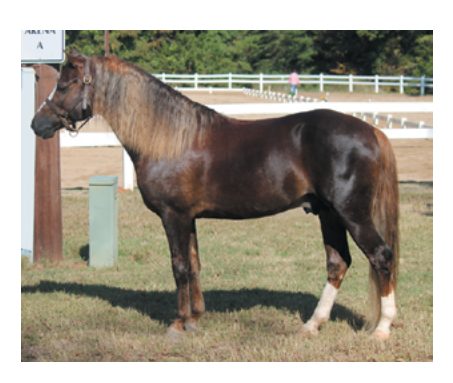
25. Liver (sooty) chestnut