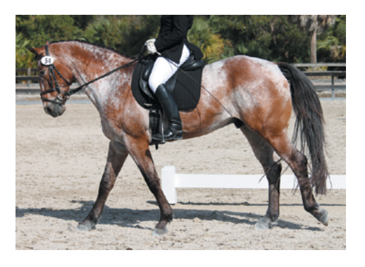
16. Varnish roan