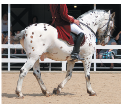
12. Nose-to-toes leopard