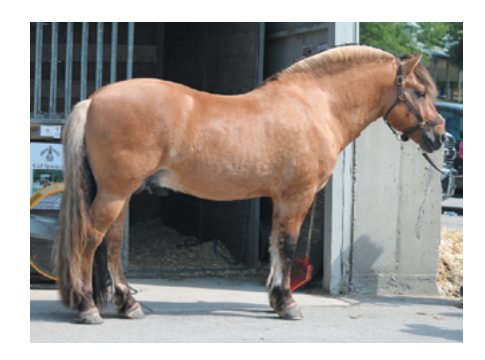
1. Wild bay dun (without mealy)

Historical colors are those thought to have been part of the breed but have been lost over time. Because this is often based on stud book records, old photographs and artwork, these designations are speculative. As with the "unknown" category, consideration should be given to persuasive documentation for colors not included here.