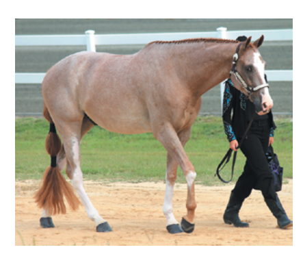
13. Sabino roan