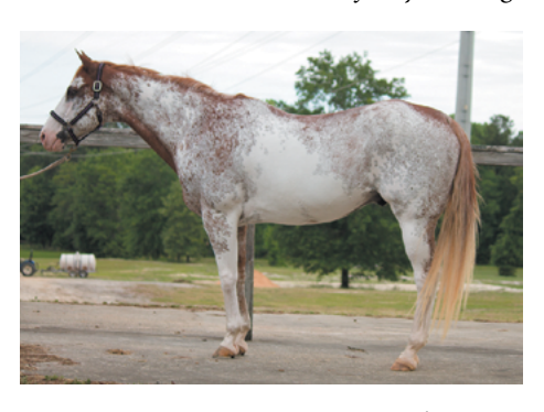
4. Sabino roan