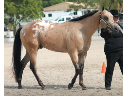
9. Buckskin spotted blanket