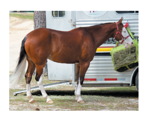
11. Splashed white