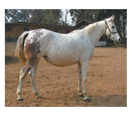
28. Blood-marked fleabitten grey