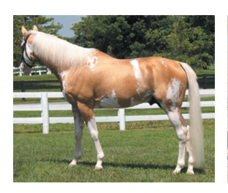
23. Patchy sabino