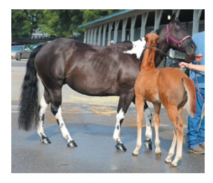
10. Tobiano with belton patterning